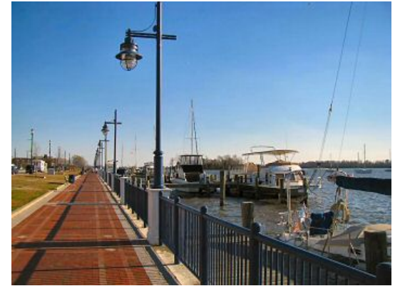
Washington waterfront

A bicycle and pedestrian trail connecting the City of Washington with the City of Greenville