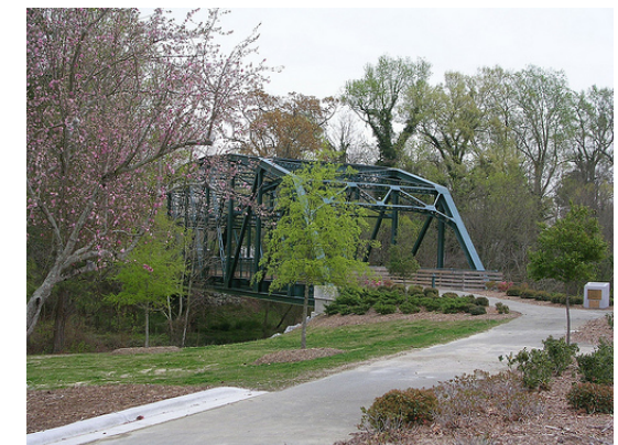
Tar River pedestrian bridge on greenway – Greenville

A bicycle and pedestrian trail connecting the City of Washington with the City of Greenville